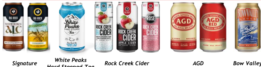
Signature White Peaks Hard Steeped Tea Rock Creek Cider AGD Bow Valley